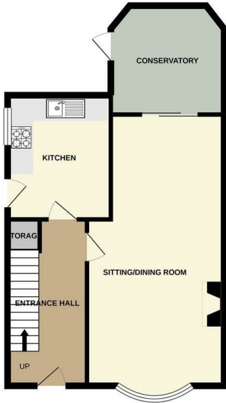
GROUND FLOOR 571 sq.ft. (53.0 sq.m.) approx.